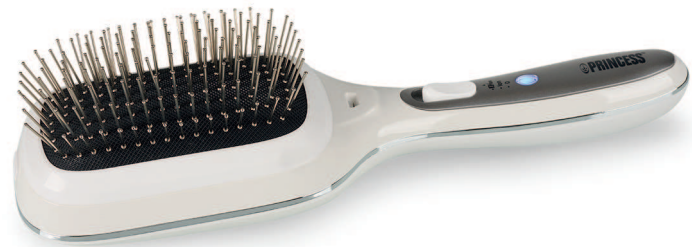
IONIC DETANGLING HAIRBRUSH with Handle 01.529431.16.001