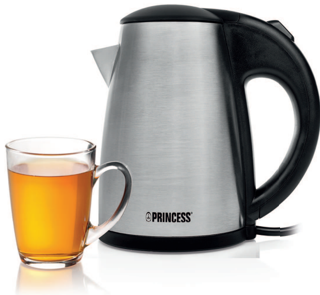
Jug kettle 01.236029.02.001