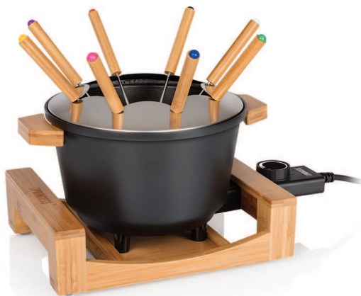
Princess Fondue Pure Black 01.173025.02.001