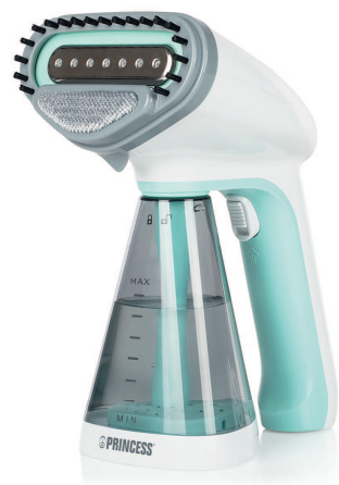
Handheld Garment Steamer 01.332846.16.001