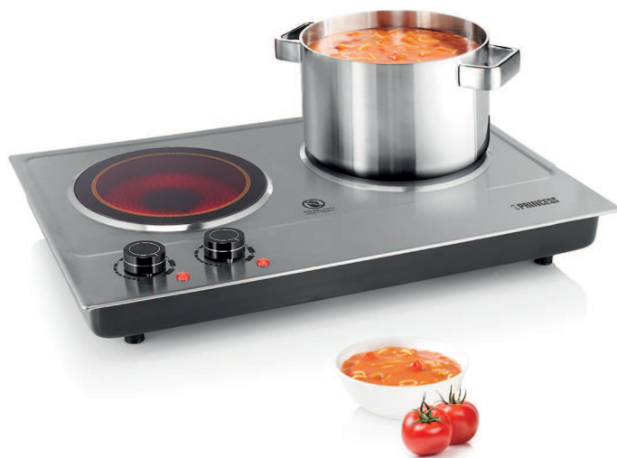
Double Ceramic Hot Plate 01.303007.10.001