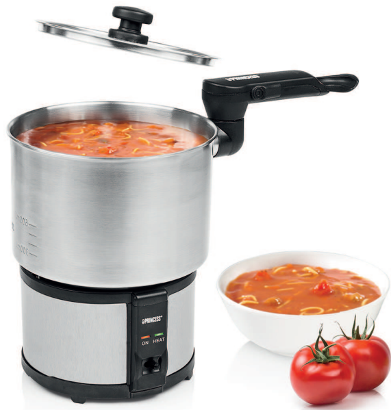
Travelling cooking pot 01.302300.02.001