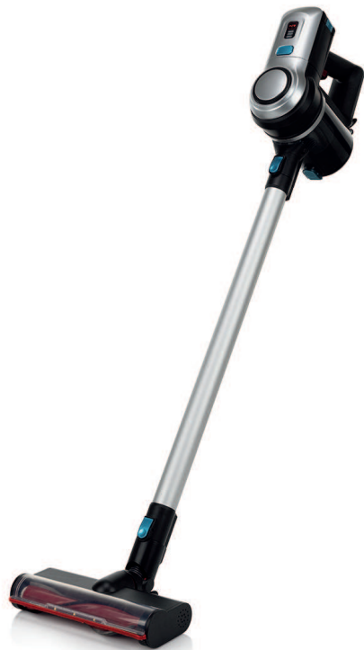
Cordless Vacuum Cleaner 01.339481.02.001