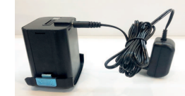
The battery can be charged directly in the device or on the battery pack.