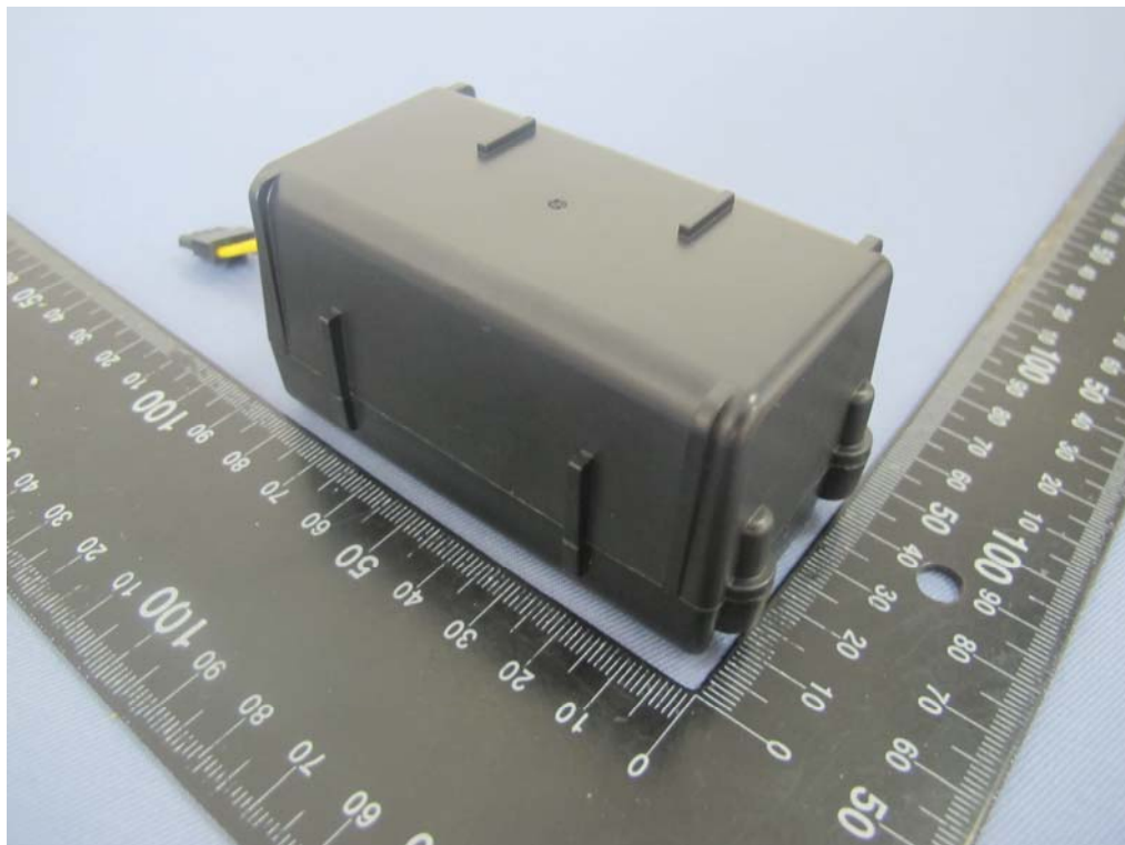
Figure 2 Bottom view of battery