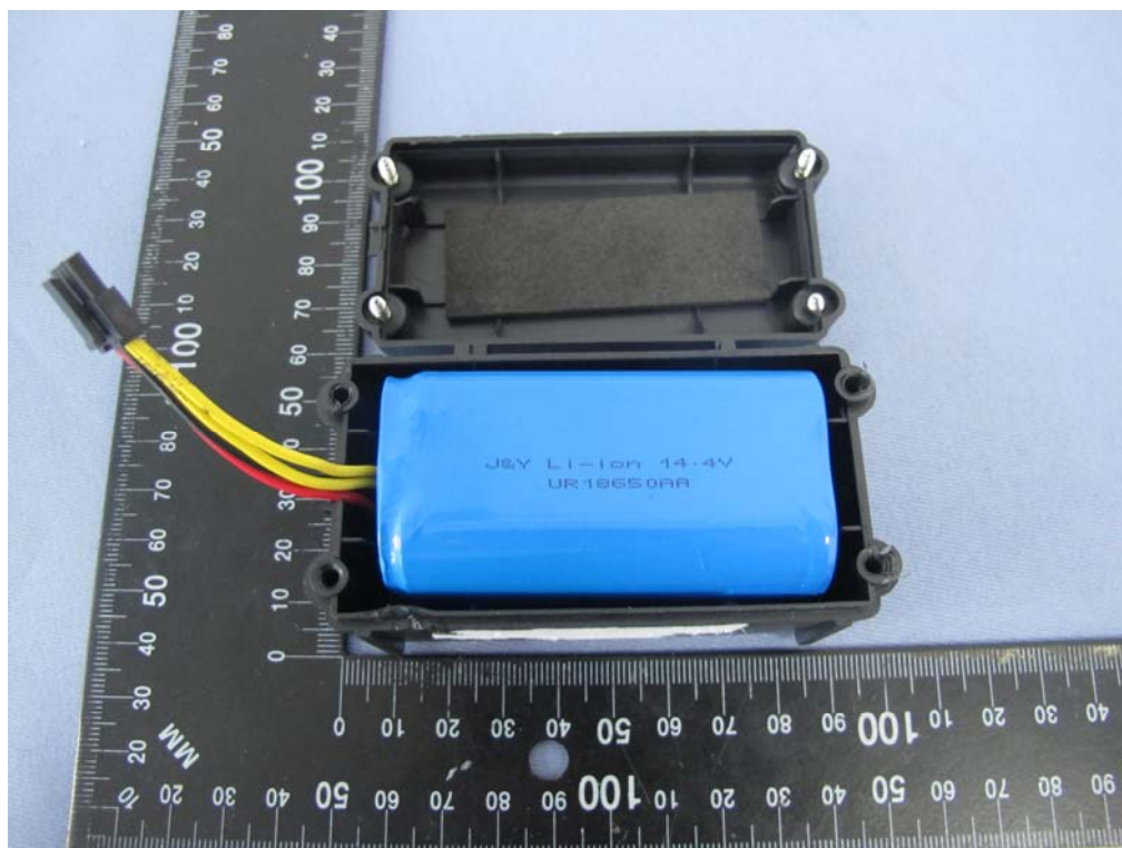
Figure 3 Internal View of battery