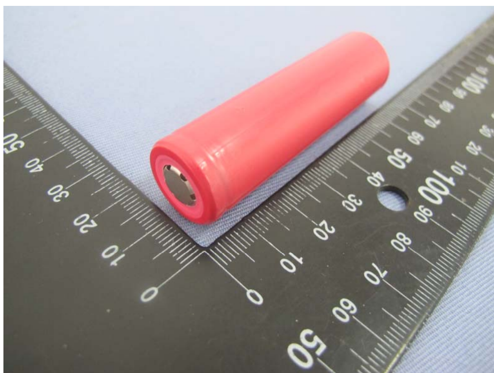
Figure 4 Overall View of cell