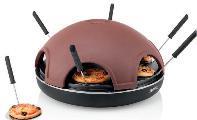
PIZZA FESTA 6 02.162391.01.001

ONDERDELENBESCHRIJVING / PARTS DESCRIPTION / DESCRIPTION DES PIÉCES / TEILEBESCHREIBUNG / DESCRIPCIÓN DE LAS PIEZAS / DESCRIZIONE DELLE PARTI / DESCRICÃO DOS COMPONENTES / BESKRIVNING AV DELAR / OPIS CZĘŚCI / POPIS SOUČÁSTÍ / POPIS SÚČASTÍ / ОПИСАНИЕ ЗАПЧАСТИ