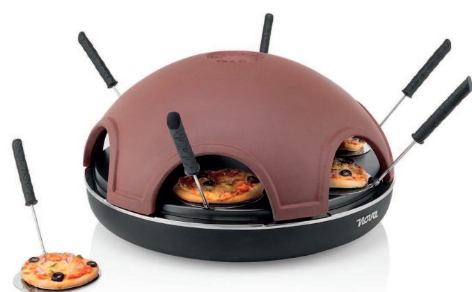
PIZZA FESTA 6 02.162391.01.001

ONDERDELENBESCHRIJVING / PARTS DESCRIPTION / DESCRIPTION DES PIÈCES / TEILEBESCHREIBUNG / DESCRIPCIÓN DE LAS PIEZAS / DESCRIZIONE DELLE PARTI / DESCRICÃO DOS COMPONENTES / BESKRIVNING AV DELAR / OPIS CZĘŚCI / POPIS SOUČÁSTÍ / POPIS SÚČASŤÍ / ОПИСАНИЕ ЗАПЧАСТІ