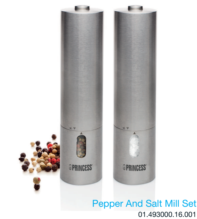
Pepper And Salt Mill Set 01.493000.16.001