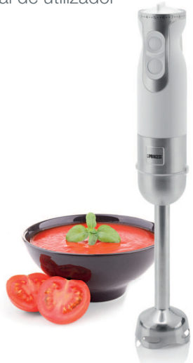
Stainless Steel Stick Blender White 01.221203.16.023

PARTS DESCRIPTION / ONDERDELENBESCHRIJVING / DESCRIPTION DES PIÈCES / TEILEBESCHREIBUNG / DESCRIPCIÓN DE LAS PIEZAS / DESCRIÇÃO DOS COMPONENTES / DESCRIZIONE DELLE PARTI / BESKRIVNING AV DELAR / OPIS CZĘŚCI / POPIS SOUČÁSTÍ / POPIS SOUČASTI