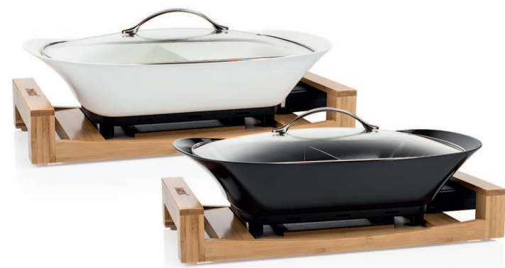
Multi Cook Pure