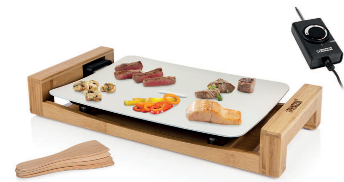
Table Chef Pure Compact 01.103035.27.001